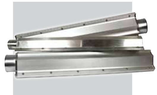
Air Knife Drying Systems