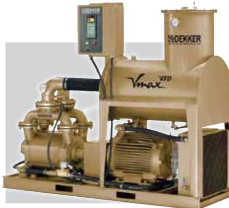
Liquid Ring Vacuum Pumps