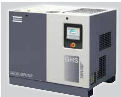
Rotary Screw Pumps