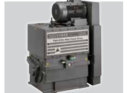
Rotary Piston Vacuum Pumps