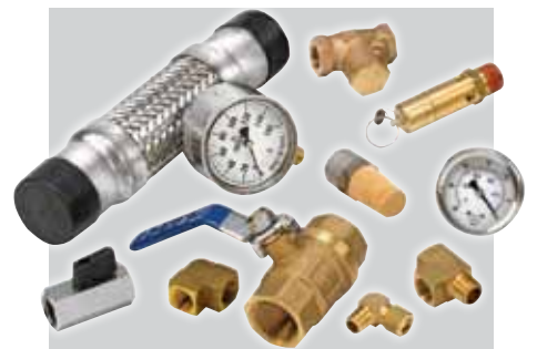
Valves & Pneumatic Accessories