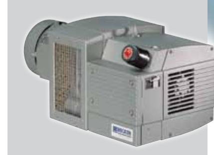
Rotary Vane Pumps