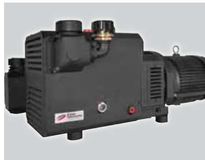
Oil-Free Claw Pumps