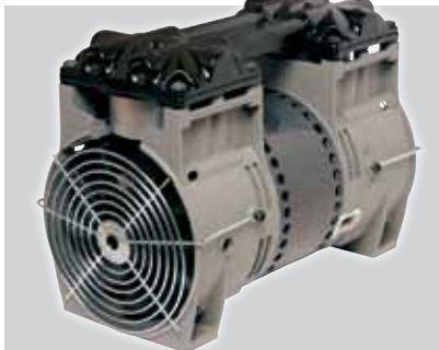
OEM Compressors & Vacuum Pumps